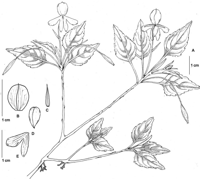
Figure 1. Impatiens butu Gavin-Sm. —A. Habit of flowering plant with immature fruit. —B. Dorsal petal, posterior view. —C. Lateral sepal. —D. Lower sepal, posterior view. —E. Lateral united petals, one pair. All based on J. A. Mlangwa 1400 (F, K, MO, NHT, WAG). Drawn by N. Gavin-Smyth.

Distribution and habitat. This new species is known only from the type collection in the South Pare Mountains (Fig. 2), one of the 13 mountain blocs of the Eastern Arc Mountains of Kenya and Tanzania (Platts et al., 2011). The South Pare Mountains are home to 50 of the 552 vascular plant species known to be endemic to the Eastern Arc Mountains (Gereau, unpublished data), and are also home to significant numbers of globally threatened species of birds, amphibians, mammals, and reptiles (Gereau et al., 2016).