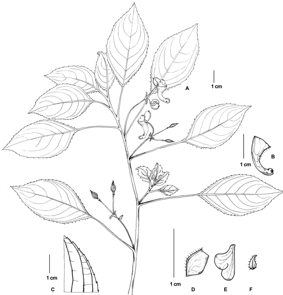
Figure 3. Impatiens ndovu Gavin-Sm. —A. Habit of flowering plant with mature fruit. —B. Lower sepal and spur, lateral view. —C. Leaf margin. —D. Dorsal petal, lateral view. —E. Lateral united petals, one pair. —F. Lateral sepal. All based on M. A. Muangoka 3588 (F, K, MO, NHT, WAG). Drawn by N. Gavin-Smyth.

substantial number of narrowly endemic taxa, including I. ndovu . This would seem to warrant a good deal of further botanical inventory, especially given the relatively large size of the Reserve (264 km 2 ) and its only moderate level of past collecting.