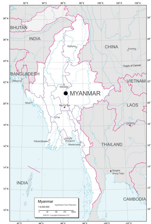
Figure 3. Type locality of Impatiens katjæ Nob. Tanaka & J. J. Verm.

placentation axillary; filaments of stigma 1.7–2 mm, white to pink. Fruits erect, fusiform, 5–6 × 2 mm at the widest position, pilose.