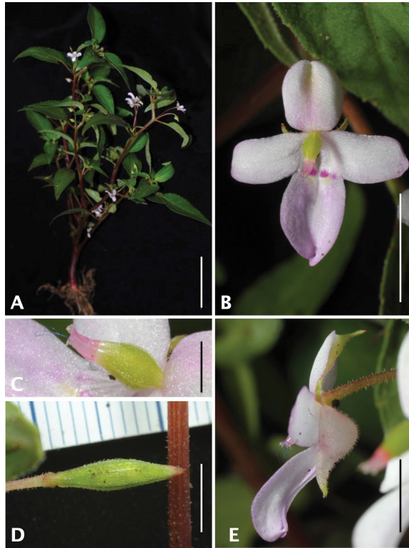
Figure 1. Impatiens katjae Nob. Tanaka & J. J. Verm. —A. Habit. —B. Front view of flower. —C. Gynoecium. —D. Fruit. Scale bars: 5 cm for A, 5 mm for B, 2 mm for C, 3 mm for D, and 4 mm for E.

Aug. 2016, J. J. Vermeulen 3959 (holotype, L!; isotypes, RAF!, TNS!). Figures 1, 2.